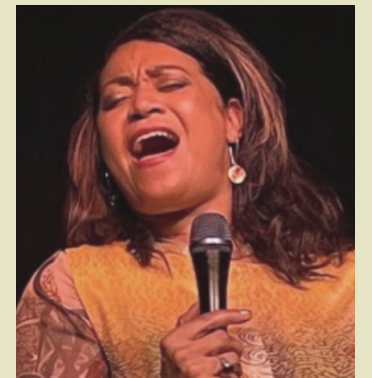
WEAVE Presents aims to provide affordable access to multicultural performing arts programming for all ages

Finally, BCF's Klasky (Trustees') Award is presented to a nonprofit with an application promoting collaboration or innovation in its request. BCF awarded $10,000 from this fund to Bainbridge Prepares to support their request for 13 Disaster Hubs in strategic locations around Bainbridge Island to ensure emergency supplies are