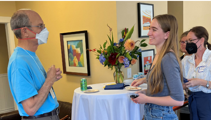
Scholarship Fund Reception at BCF

On July 26th, BCF hosted an inaugural reception to honor each student and give them an opportunity to meet the people behind the scholarship funds. To receive scholarships, students have to have shown outstanding character or initiative in a particular area, such as community service, STEM work, the arts, or