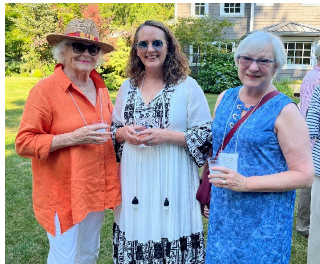
BCF Fund Advisors

To learn more about how you could become a Fund Advisor with BCF, visit our website at www.BainbridgeCF.org or email us at info@bainbridgecf.org . Please don't hesitate to contact us with any questions.