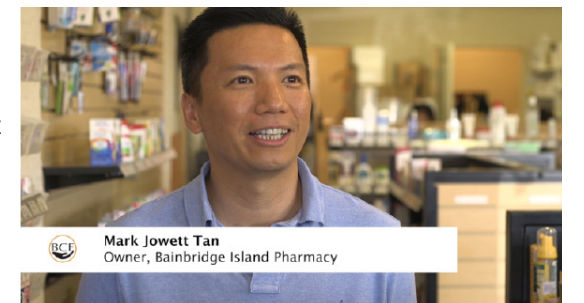
BCF produced a short film on the Bainbridge Island vaccination effort, available at www.BainbridgeCF.org